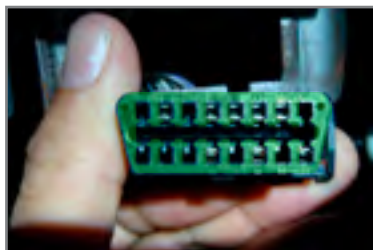
16 pin OBDII type connector