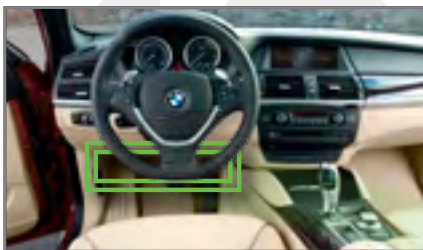
common location of OBD connectors