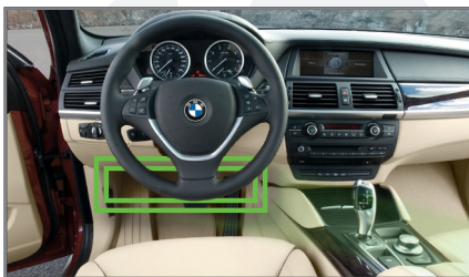
common location of OBD connectors